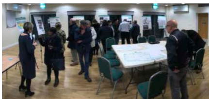
Seeking the view of the local community on the proposals

Meetings are now taking place to bring forward and discuss community facilities in the central village.