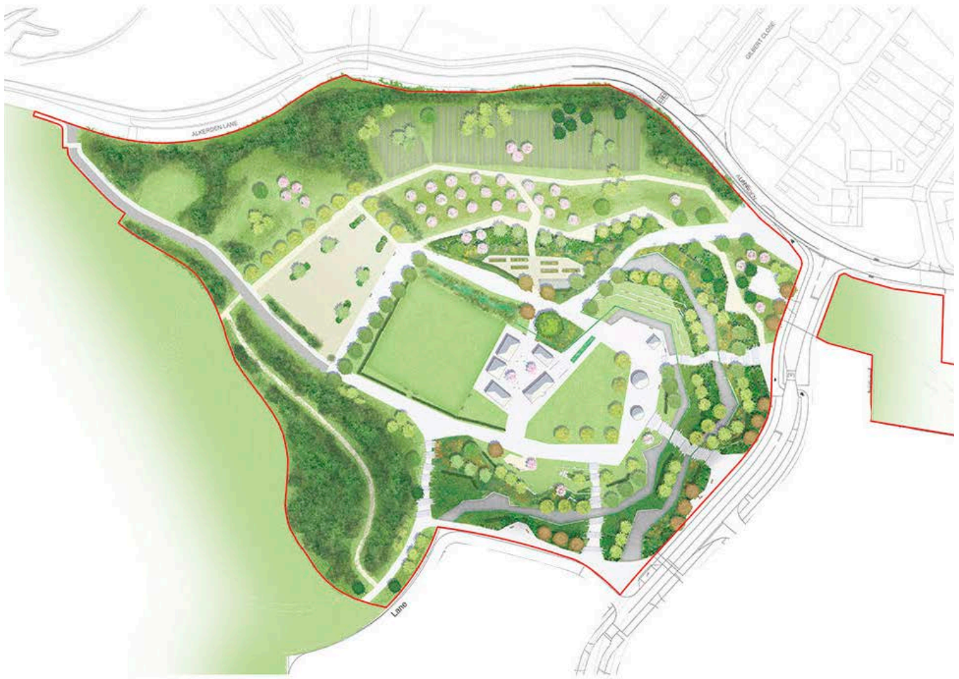
How the area in red above might be laid out with a mix of uses and activities