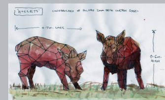
Foraging pigs by Andy Hazell

We are also pleased to announce that the public art proposals previously chosen by residents for Castle Hill Central area; have now received planning approval, and they will be installed in Spring/Summer 2021 after fabrication. These include the following pieces: