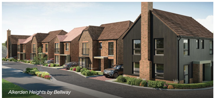
Alkerden Heights by Bellway

First residents have moved into Westerhill Homes' 67 custom-built properties, including 25% of affordable homes.