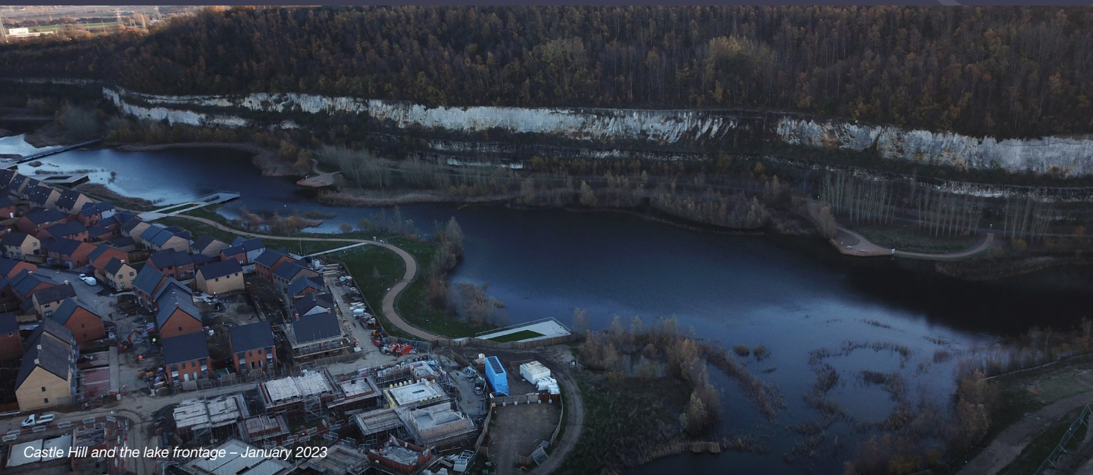
Castle Hill and the lake frontage – January 2023

WELCOME TO THE LATEST NEWSLETTER FROM HENLEY CAMLAND, DESIGNED TO KEEP YOU UP-TO-DATE WITH PROGRESS AT WHITECLIFFE.