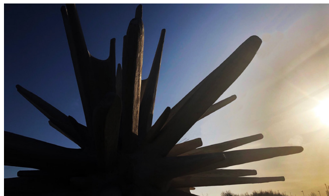
Installation of 'The Explosion' public art piece