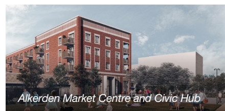
Alkerden Market Centre and Civic Hub

Henley Investments has submitted a Reserved Matters Planning Application to Ebbsfleet Development Corporation (EDC) showing detailed design for the Market Centre, Nursery, Neighbourhood Green and new homes.