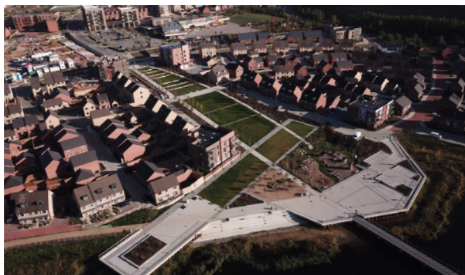
The opening of the Platinum Jubilee Park and lake frontage Castle Hill

As ever a busy year at Whitecliffe as we remind ourselves of some of the milestones: