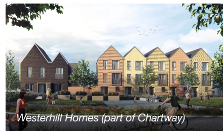
Westerhill Homes (part of Chartway)

First residents have moved into Westerhill Homes' 67 custom-built properties, including 25% of affordable homes.