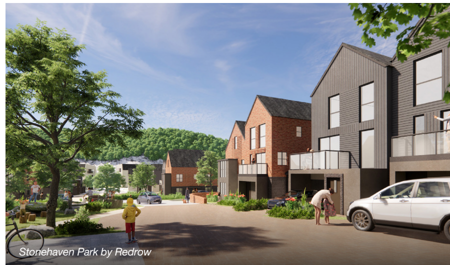
Stonehaven Park by Redrow

New homes are well underway in Alkerden with the following developers on board: